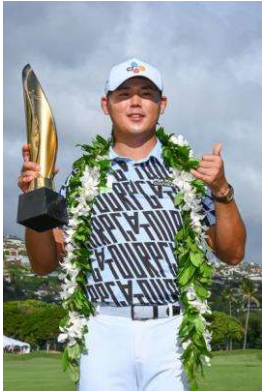
Si Woo Kim Sony Open in Hawaii

Si Woo Kim earned his fourth PGA TOUR career victory at the 2023 Sony Open in Hawaii.